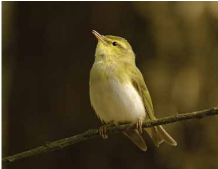
Sue Tranter (rspb-images.com)

Thus, it is important to identify which species are under threat of extinction within the UK (and we should not be blasé – there are a growing number), and which species we have a responsibility to conserve in the global battle against extinction. It is also important that any exercise designed to set species priorities for conservation in the UK should consider a wider range of parameters. The 58% decline in numbers of Sky Larks Alauda arvensis over the last four decades equates to a loss of approximately 4 million individuals. Although the Sky Lark remains common and is not threatened with national extinction, this is biodiversity loss on an enormous scale. As a result, the setting of species priorities in the UK has evolved to recognise such loss. In addition, it takes accounts of instances where species have been depleted owing to pressures in the past, the