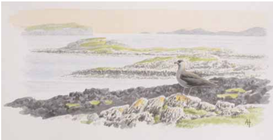
Arctic Skua Stercorarius parasiticus